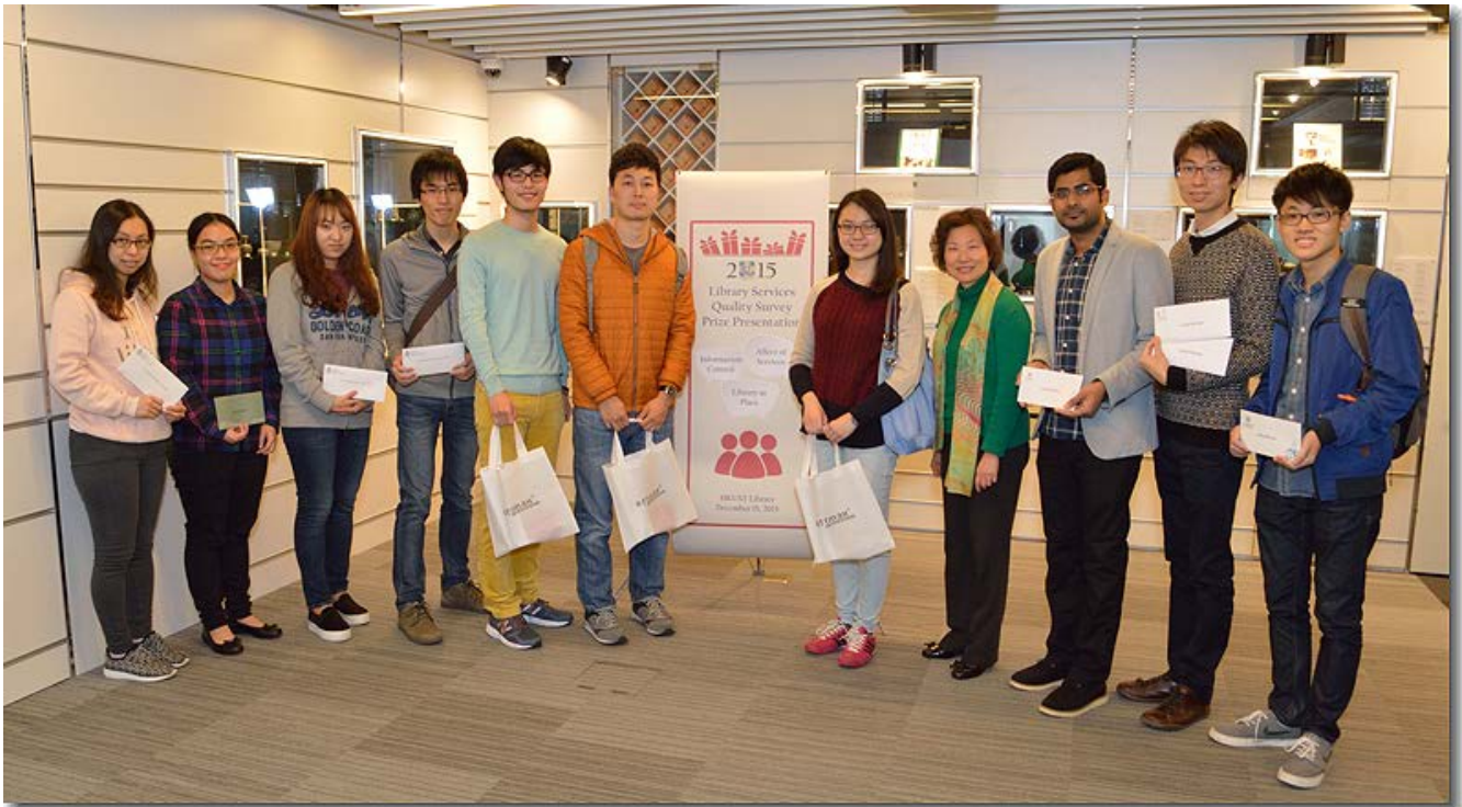
Prize Winners and the University Librarian

To include as many University members as possible, we offered incentive prizes and sent email notices inviting broad participation. 3,518 of you completed the Survey, a response rate of about 20%. 58 prize winners were drawn in the lucky draw, and received their prizes on 15 December.